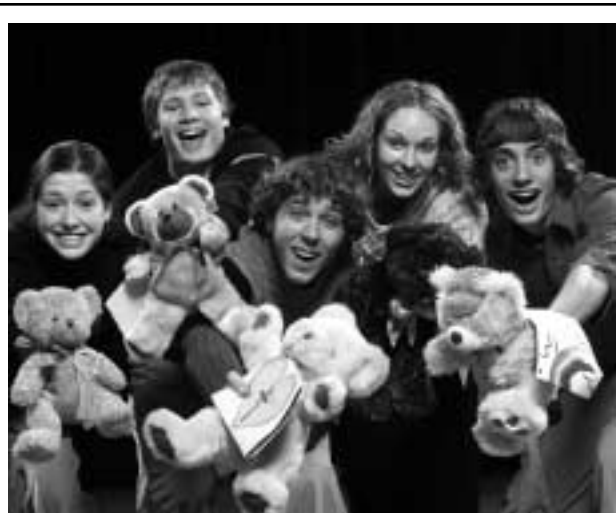
Northwestern's Drama Ministries Ensemble brings biblical truths to life on stage, exploring AIDS, drug abuse, homelessness and now the aftermath of September 11 through the light of the Gospel and its message of compassion and grace.

Initiatives: To provide leadership for integrating worship and the arts, Vocare will: