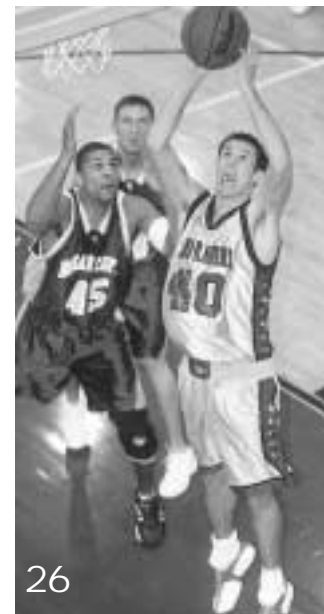
page35 God's Hands and Feet Classic Thoughts

secured through the efforts of Iowa Congressman Tom Latham, a senior member of the House Appropriations Committee. "These funds will help make this beautiful new center a reality," said Latham. "The center will be a great resource for northwest Iowa to high-quality theatre productions and education."