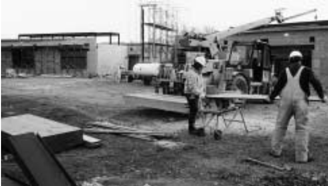
The Thea Korver Visual Arts Center, located on Hwy. 10, just east of the Subway restaurant, took shape during the winter months.