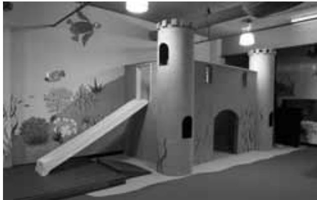
Climbing walls, fish tanks and two-story sand castles all are part of Faith Church’s “Treasureland” children’s area.