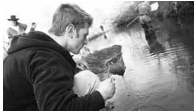
The ecological science major is among 11 Northwestern programs listed in Rugg's Recommendations on the Colleges.

Two of Northwestern's programs were listed in a special category, miscellaneous majors: athletic training, in which NWC was one of 69 colleges and universi-