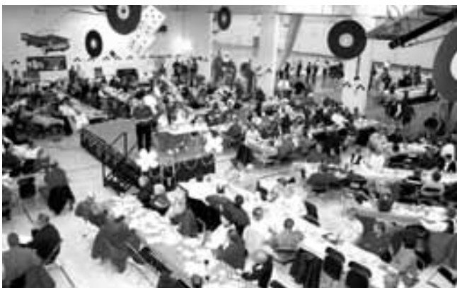
More than 600 people attended the '50s-themed Gala Auction.

The 21st annual Northwestern College Gala Auction raised over $40,000 on Feb. 21. The total is the second highest amount of auction funds raised in school history.