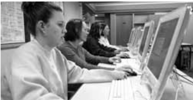
A new computer information systems major will prepare students to work as information technology professionals in any business setting.