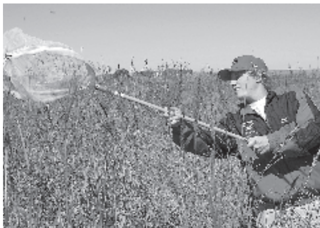
Ecological science is one of Northwestern’s 13 programs listed in Rugg’s Recommendations on the Colleges .

Rugg’s publication relies heavily on random polls of students at those colleges.