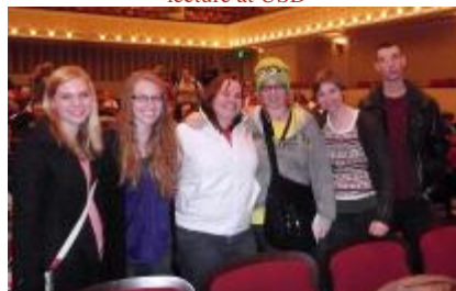
Students attend Frank Warren's PostSecret lecture at USD